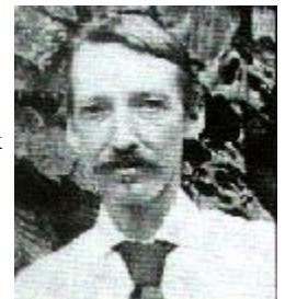
Robert Louis Stevenson (1850-1894)

Robert Louis Stevenson was born in Scotland in 1850. His first novel was Treasure Island , published in 1883. Dr. Jekyll and Mr. Hyde , published three years later, became a best-seller. The book Kidnapped came out the same year and established Stevenson as a famous author. In addition to writing novels, Stevenson was also an accomplished poet, and wrote many poems for young children.